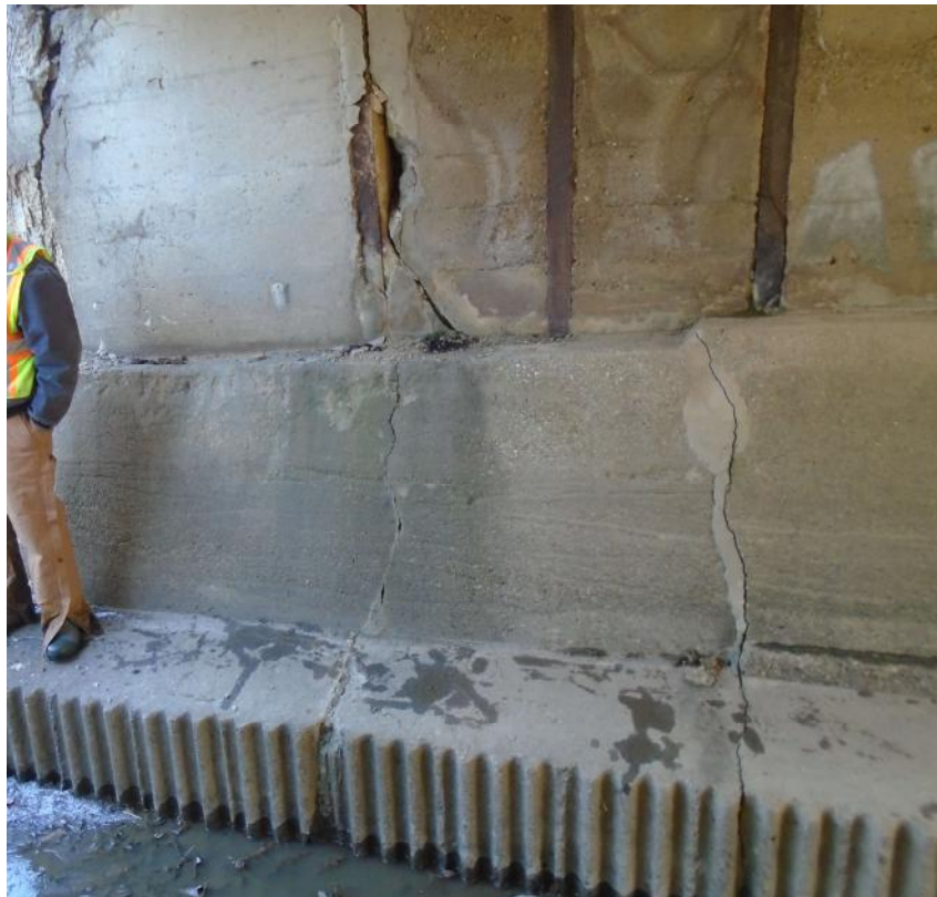
Abutment – Previous Repairs Cracked and Failing