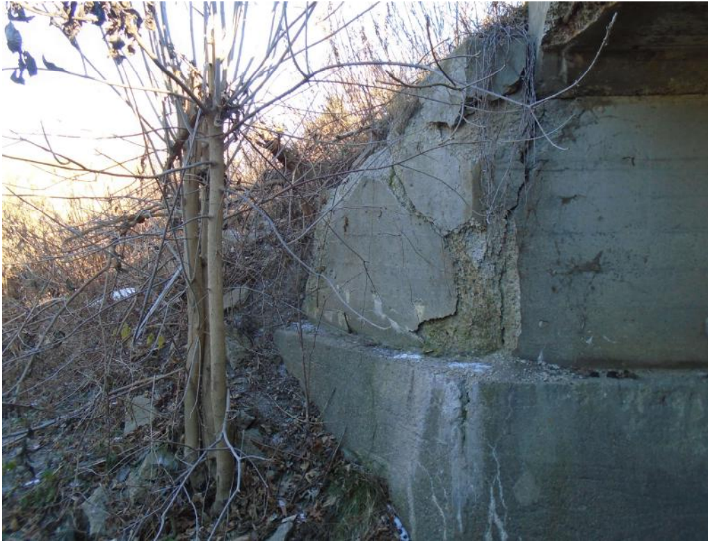
Abutment and Wingwalls – Concrete Crumbling